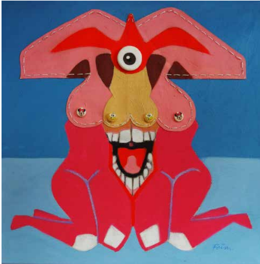
Mouth 2, 2020 Mixed Media 45 x 45cm