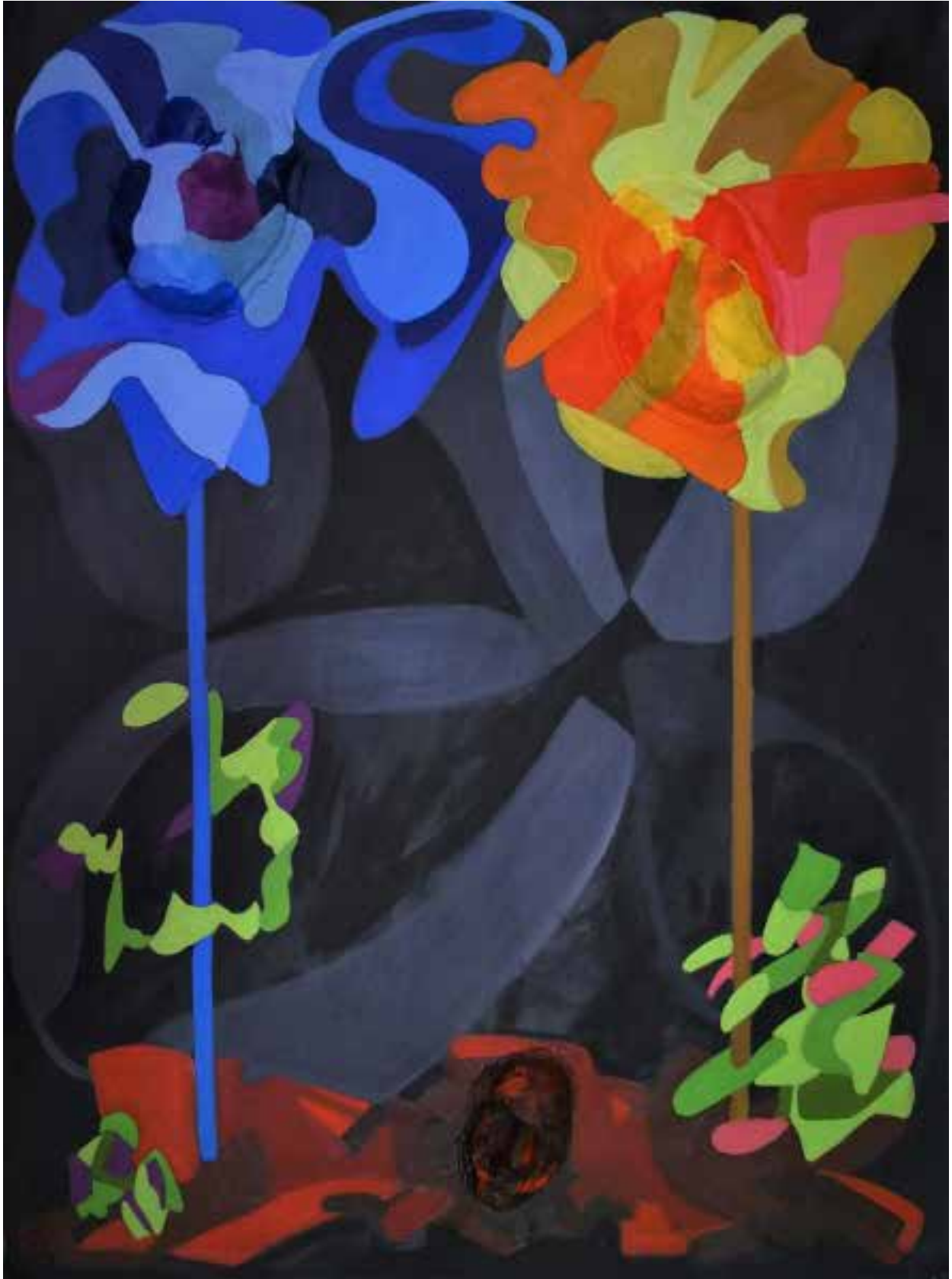
Blue And Orange Flower, 2020 - Oil / Mixed Media 76 x100cm

超现实就像一本自传，是一个人基于艺术家潜意识的“绝对现实”。艺术家给出标题和文字说明，然后由观赏者下意识地去理解。