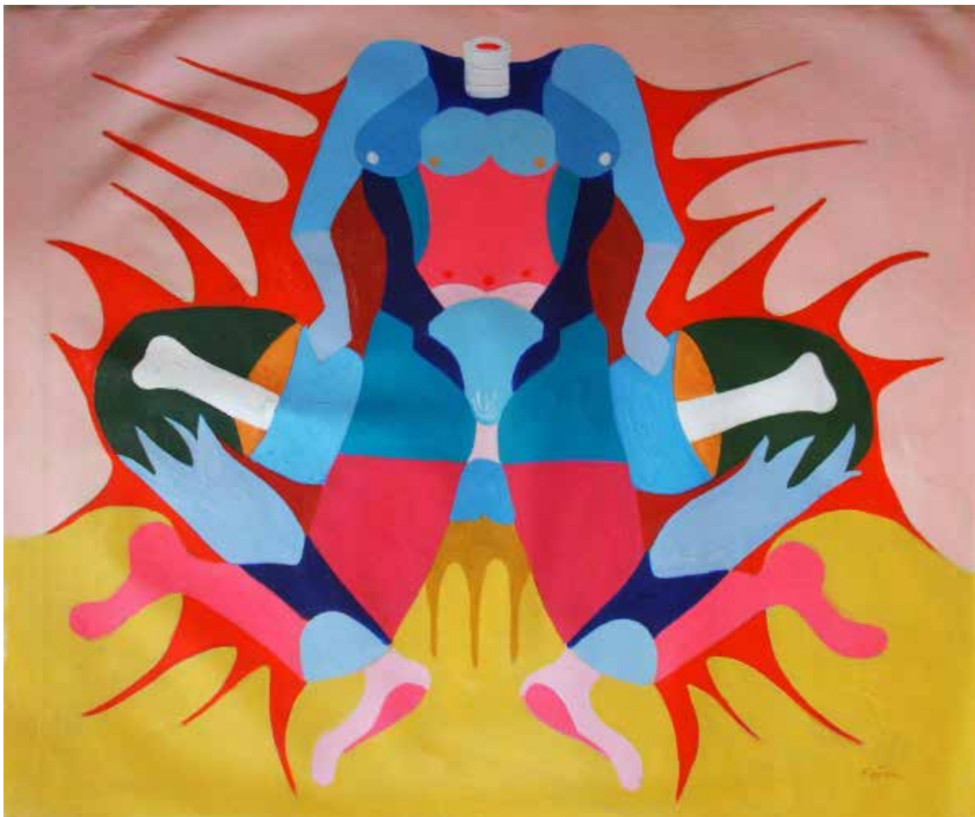
Bones 3, 2020, Oil on canvas 70 x 82cm