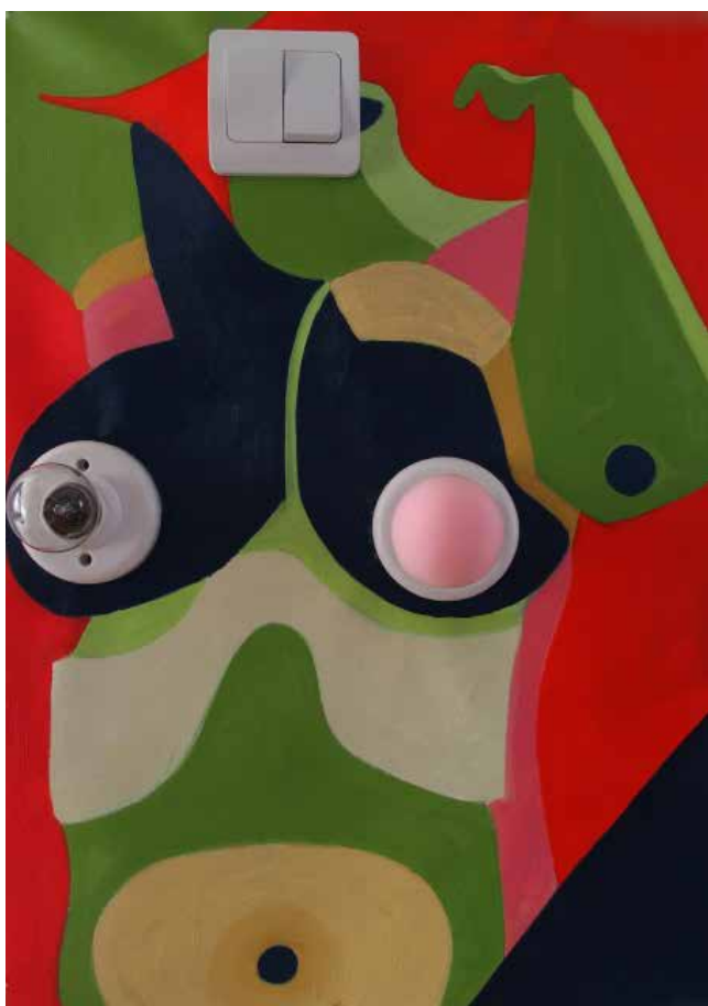
Right Brain Left Brain, 2020 Mixed Media 42 x 57cm