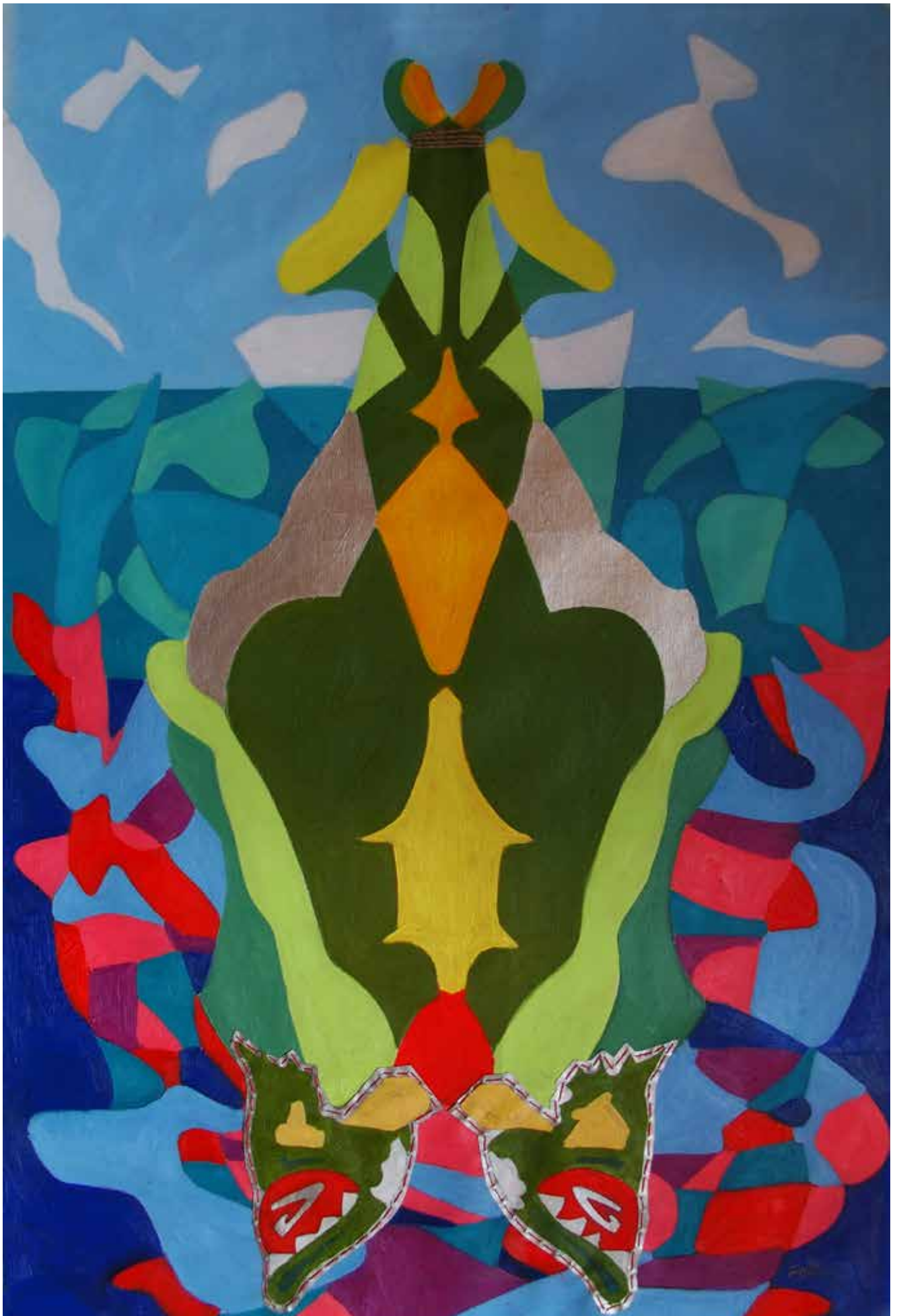
Fishhead, 2020 - Mixed Media 66 x 100cm