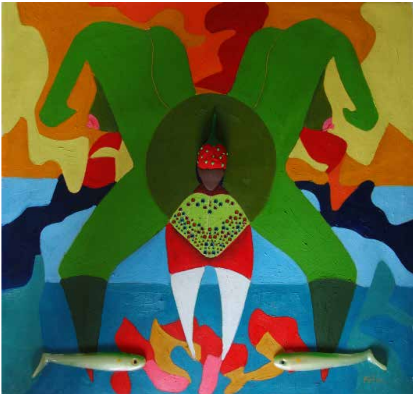
Fishing, 2020 Mixed Media 60 x 60cm