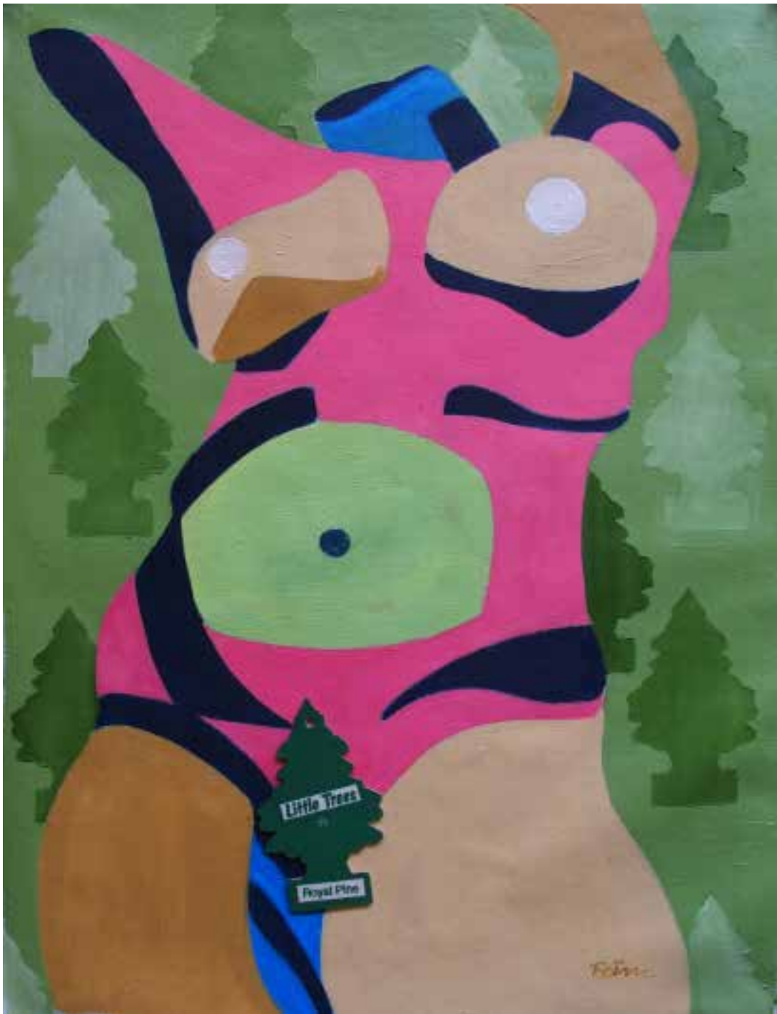
Royal Pine, 2020 Mixed Media 42 x 57cm