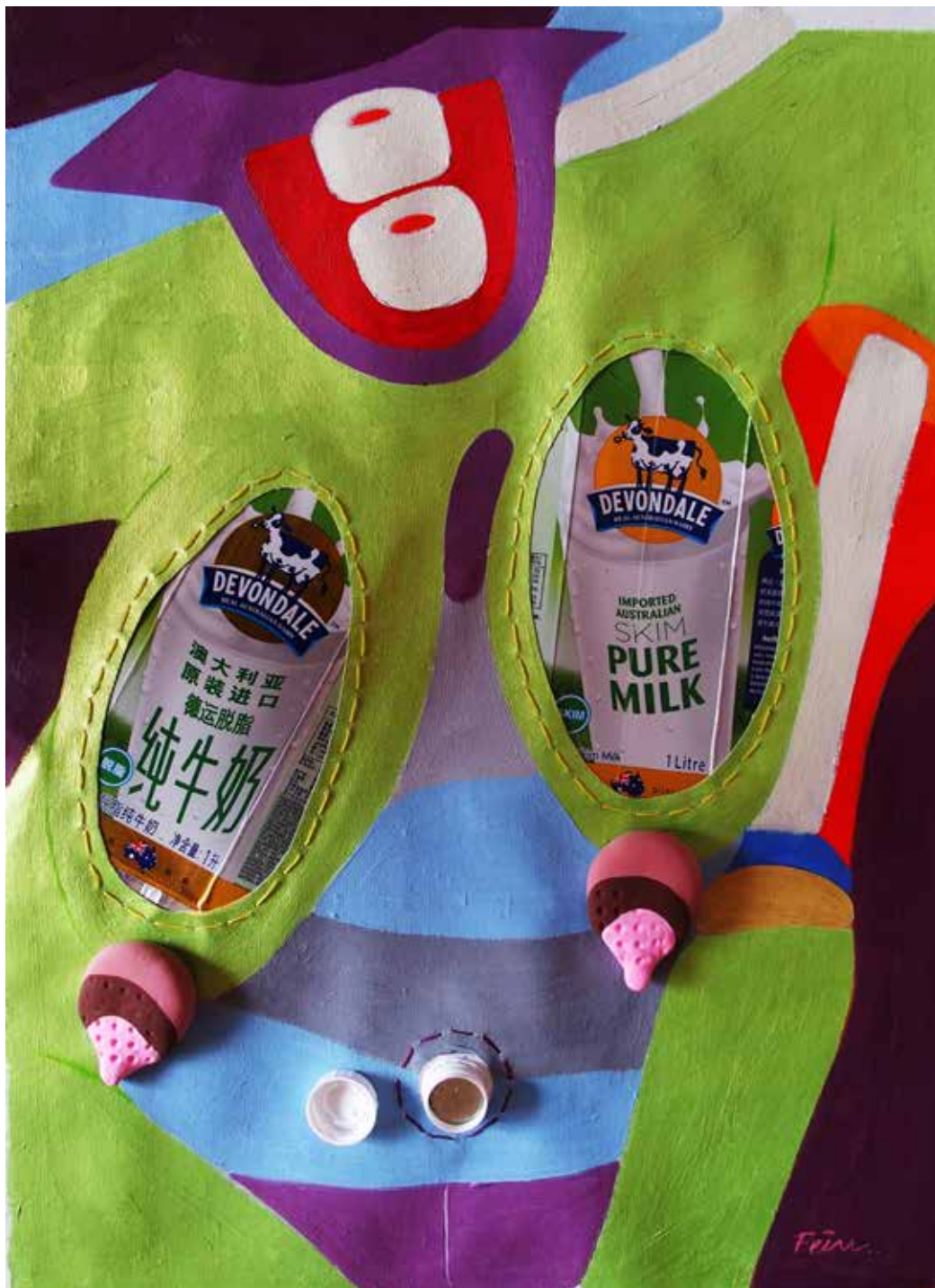
Got Milk, 2020 Mixed Media 42 x 57cm