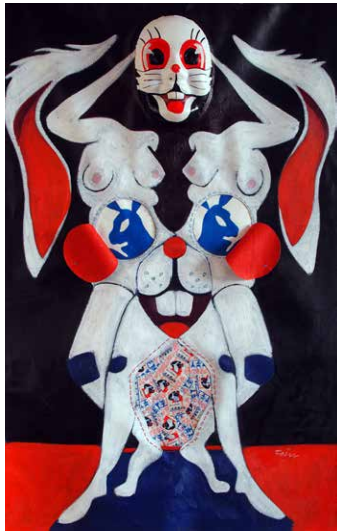
Mask 2 White Rabbit, 2019 Oil on Canvas Mixed media Found Objects 63 x 100cm