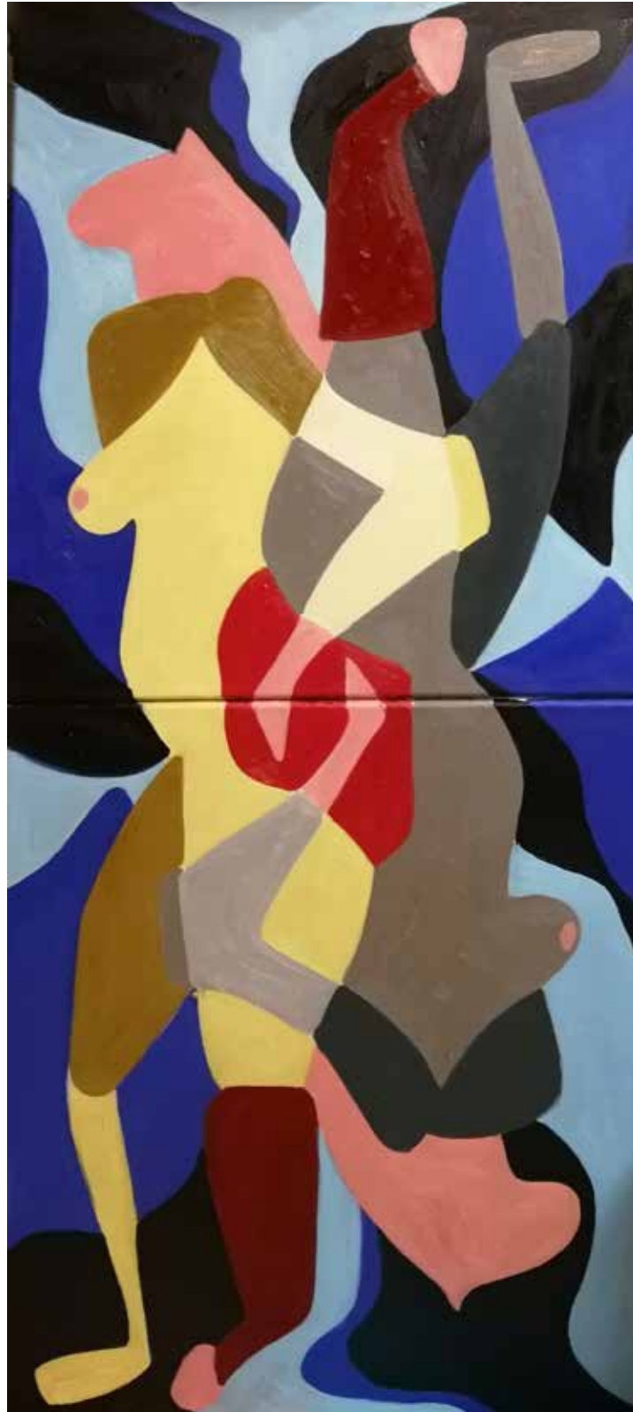
Horsehead, 2020 - Oil on Canvas 90 x 120cm

此刻的心情。当下的觉悟。意识的清醒状态。潜意识过程的局促。理查德深刻地经历了一个人的生活。他继续审视和扩展他的意识状态和生活经验，朝着一种智力简化和精神简化的方向发展。