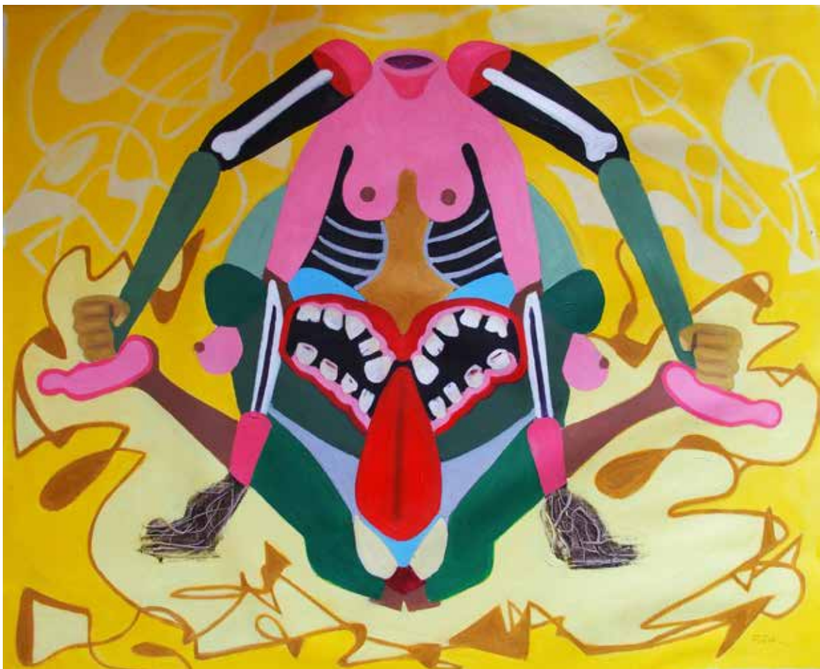
Mouth, 2020, Oil on Canvas 68 x 82 cm