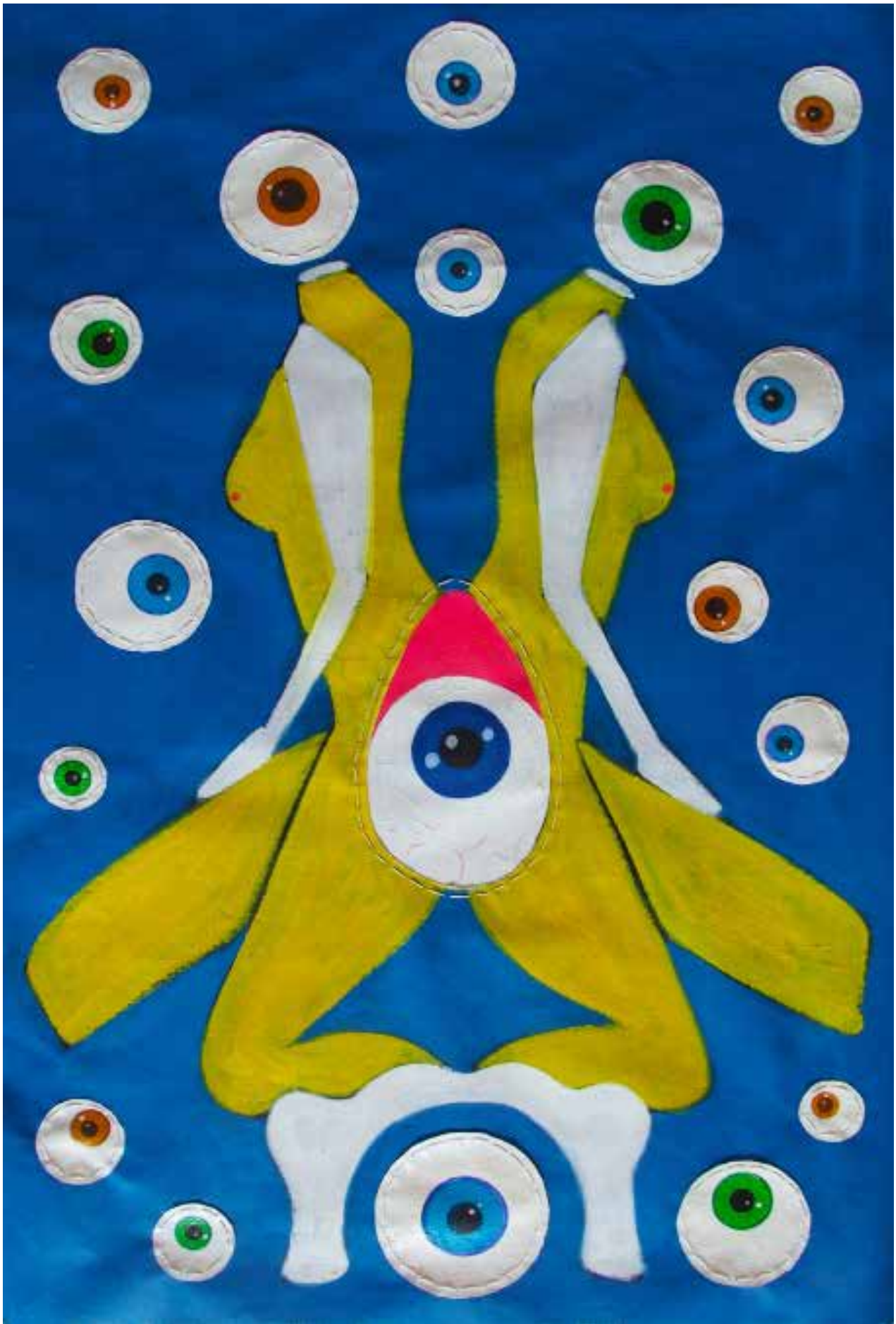
Eyeballs, 2020, Oil, Mixed Media on canvas 60 x 90 cm