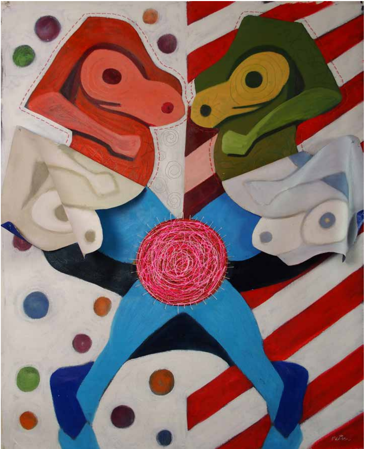
Circus 2, 2019 - Oil on Canvas thread 73 x 95cm