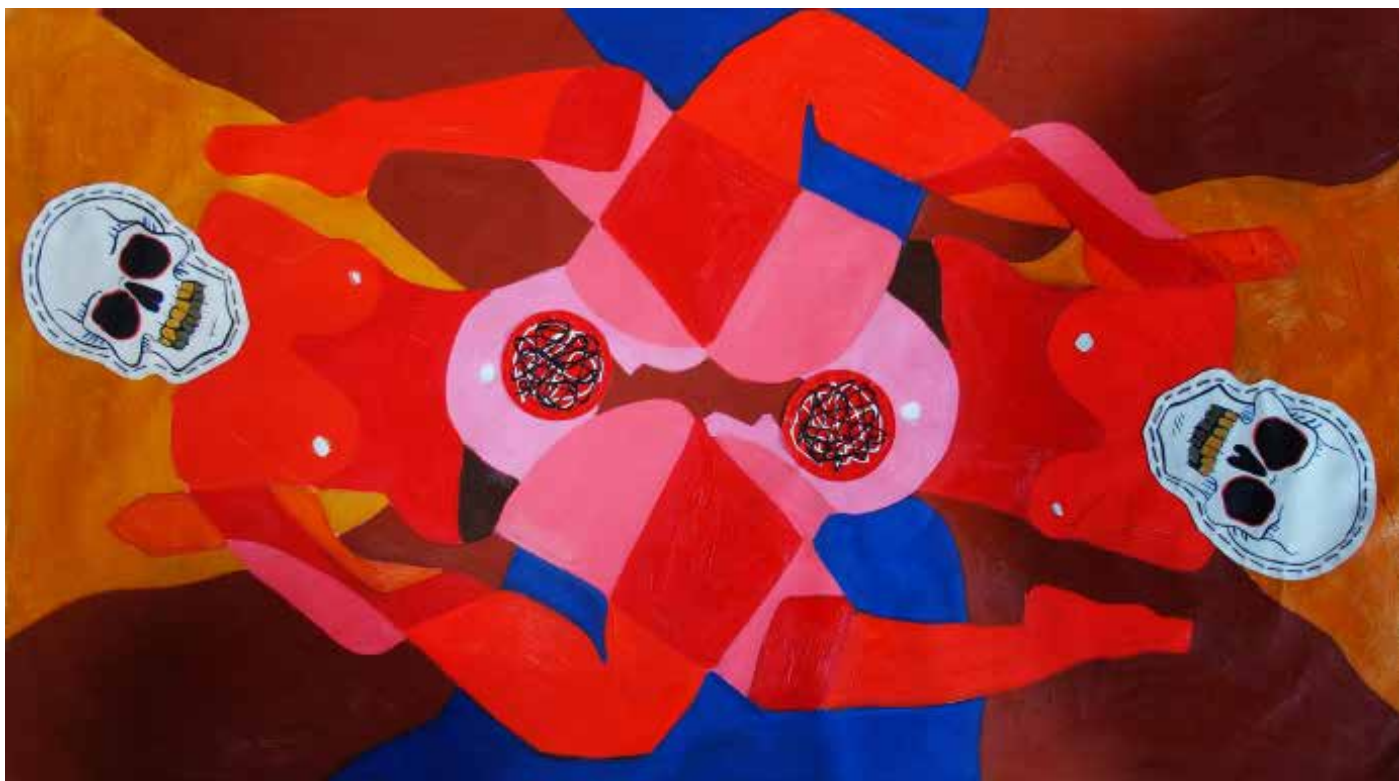
Red Skulls, 2020 Oil Mixed Media 56 x109cm