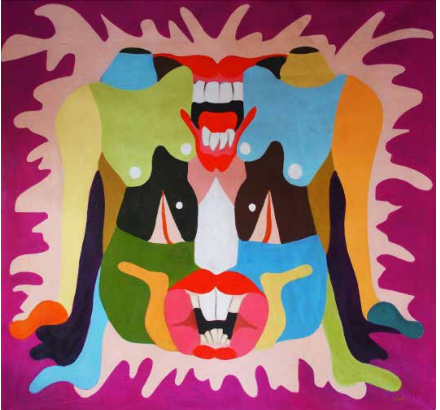
Mouth 3, 2020, Oil on canvas 84 x 87cm