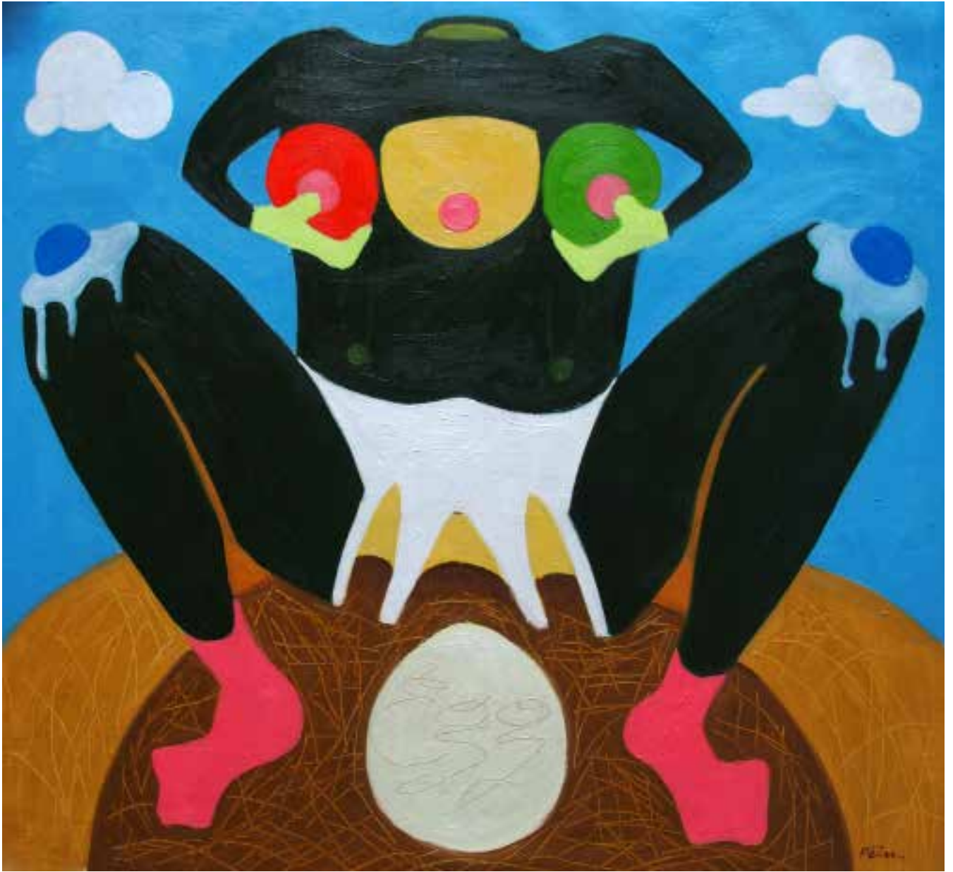
Egg, 2020 Oil on Canvas 60 x 60cm