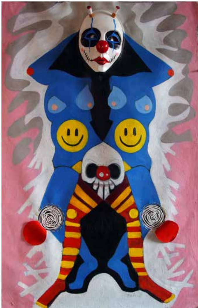
Mask 1 Circus, 2019 Oil on Canvas / Mixed media Found Objects 66 x 100cm