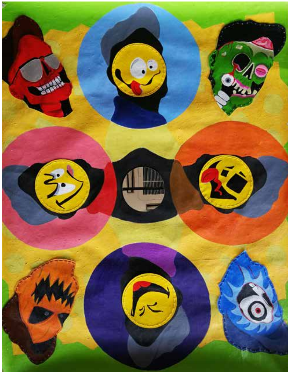
Voices in my Head, 2019 - Oil and Acrylic on Canvas 116 x 94cm