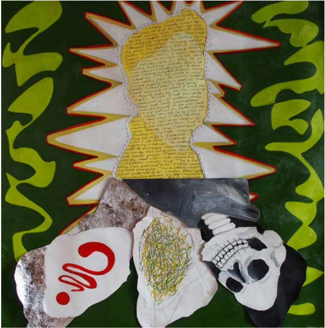
I am Nobody, 2019 - Oil on Canvas Mixed Media 84 x 90cm