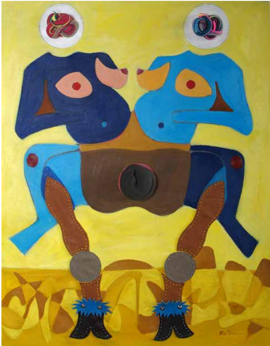
Women Satyr, 2019 - Oil on Canvas, Leather 68 x 85cm